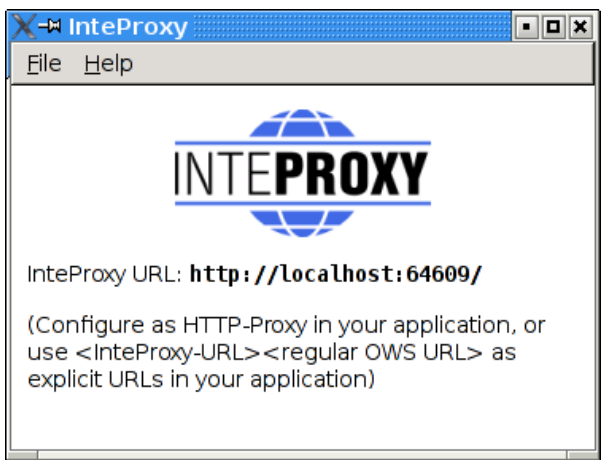
Figure 4: Graphical user interface of InteProxy (GNU/Linux)

Alternatively you can tweak your InteProxy-entry inside the Windows start menu. More detailed information can be found in section 4.2.