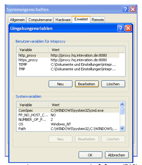
Figure 6: Adjust environment-variables (Windows XP)

There you can add the environment variables 'http_proxy' and 'https_proxy' (depends on your network configuration) and set appropriate values. An example is shown in fig. 6: