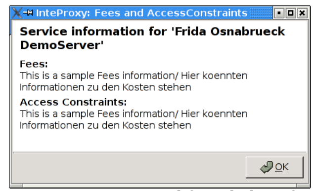
Figure 7: AccessConstraints and fees dialog after loading a OWSProxy-service

After connection a window with the servers fees and access-constraints will be shown (see fig. 7).