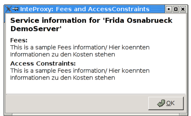
Figure 7: AccessConstraints and fees dialog after loading a OWSProxy-service

After connection a window with the servers fees and access-constraints will be shown (see fig. 7).