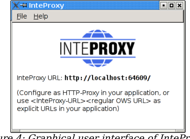
Figure 4: Graphical user interface of InteProxy (GNU/Linux)

Alternatively you can tweak your InteProxy-entry inside the Windows start menu. More detailed information can be found in section 4.2.